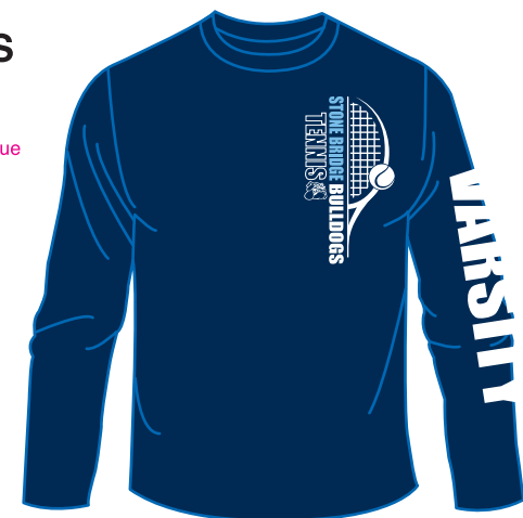
L/S T (Front) Actual Design 4" x 7.5"