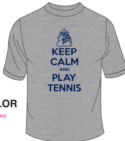
S/S T (Front) Actual Design 8" x 15"