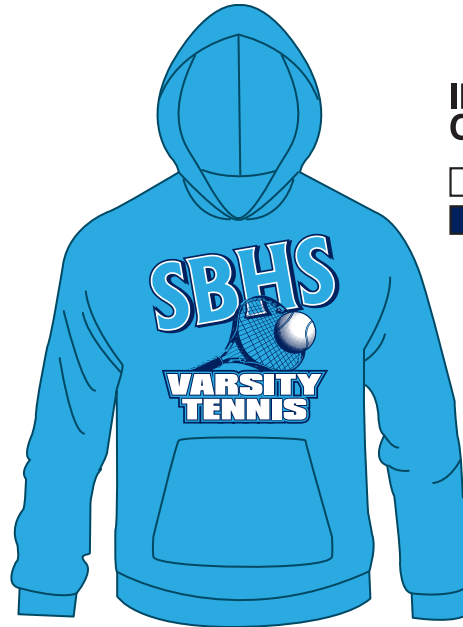
HOODED (Front) Actual Design 10.5" Wide